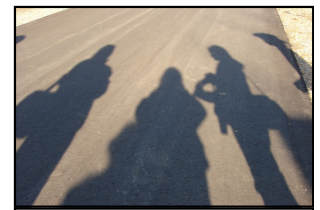
Cast your shadow on the trail!

Included in this support letter is a drawing of the proposed Mill Pond Park. It is an impressive plan that will welcome trail users coming into Concord.